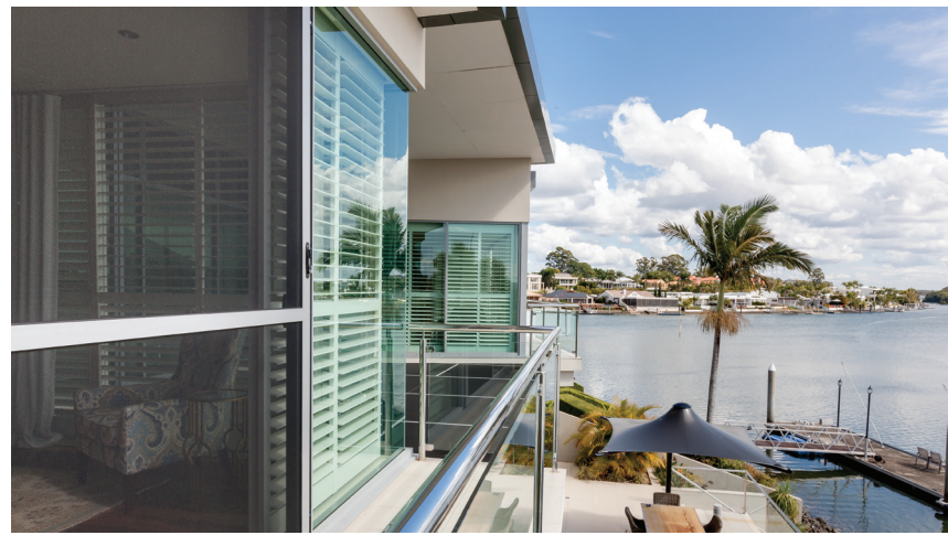
Seaside views without fear of corrosion and damage thanks to 316 marine grade stainless steel.

Extreme weather events affect the northern regions of Australia on a yearly basis. These ferocious tropical cyclones are characterised by strong winds, torrential rain and storm surges that cause havoc and disruption to communities, homes and commercial building premises. Screening products are now becoming more critical than ever before to prevent injury as well as preventing damage to property.